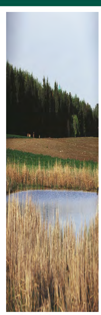
Farm Service Agency

Partners typically provide 30 percent of the total project cost in the form of direct payments to participants, in-kind contributions, or technical assistance.