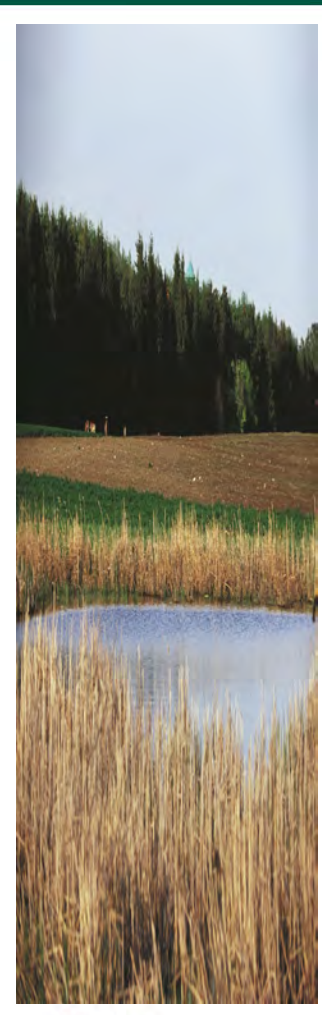
Farm Service Agency

https://www.fsa.usda.gov/programs-andservices/outreach-and-education/webinars/index