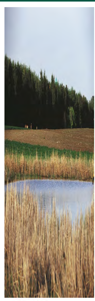
Farm Service Agency