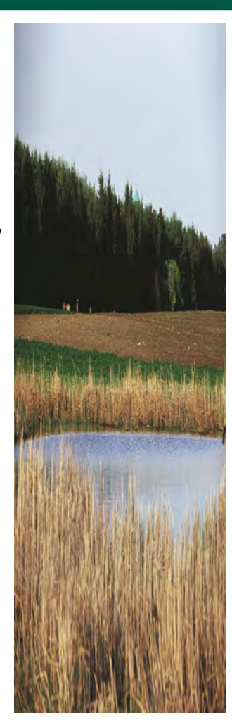
Farm Service Agency