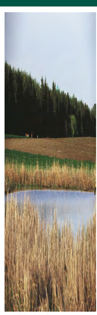
Farm Service Agency