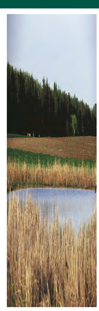
Farm Service Agency

Based on annual NASS pastureland rental rates.