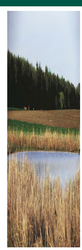
Farm Service Agency